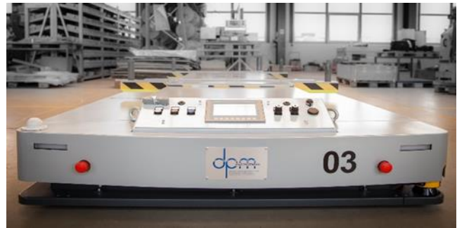
Via the sWave.NET® technology, AGV can be woken up from their deep-sleep mode with no delay

Originally, steute operated its wireless network exclusively with sWave.NET®, its own wireless technology. It belongs to the class of Low Power Wide Area Networks