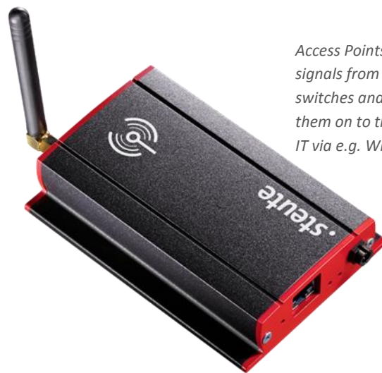
Access Points receive wireless signals from individual switches and sensors and pass them on to the superordinate IT via e.g. WiFi or Ethernet.

In a next step, the wireless network could assume additional functions – e.g. the management of replenishment supplies to vehicle assembly points. In this case, stationary or mobile eKanban racks – which could likewise be on AGV – would detect occupancy or the removal of containers and pass on this information to the material flow management system. Wireless sensors could also be installed at the transfer points between stationary and mobile conveyor equipment, signalling to an AGV that a container is ready to be transported, generating a corresponding pick-up order or commanding an AGV to start moving.