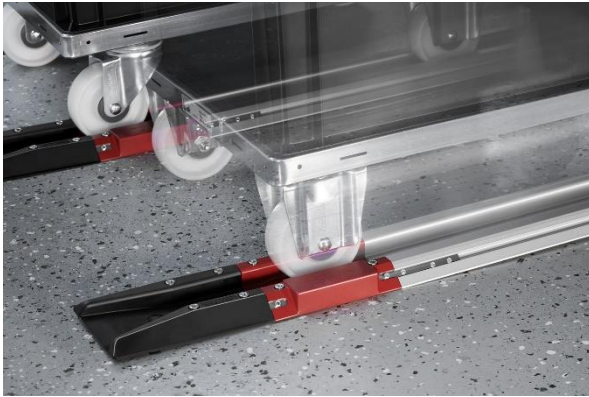
In the "stations" or "material supermarkets", sensors capture the position of dollies and trolley train trailers.

This all means: when stock levels are captured, there are both spatial and temporal discrepancies. Towards the end of the flow chain, the IT system presents not a realistic picture, but a rough estimate.